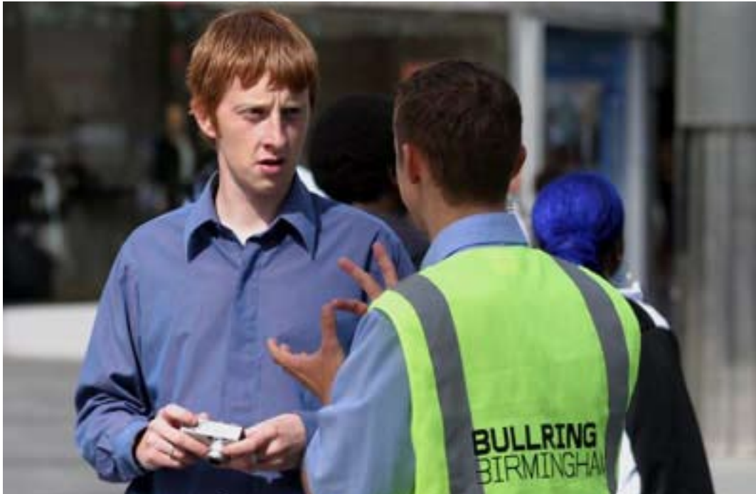
iv. Birmingham Bullring

Endorsing the Fareham shopping centre's position, a centre manager in neighbouring Havant offered his own procedural arrangements to a local newspaper, by way of further explanation: