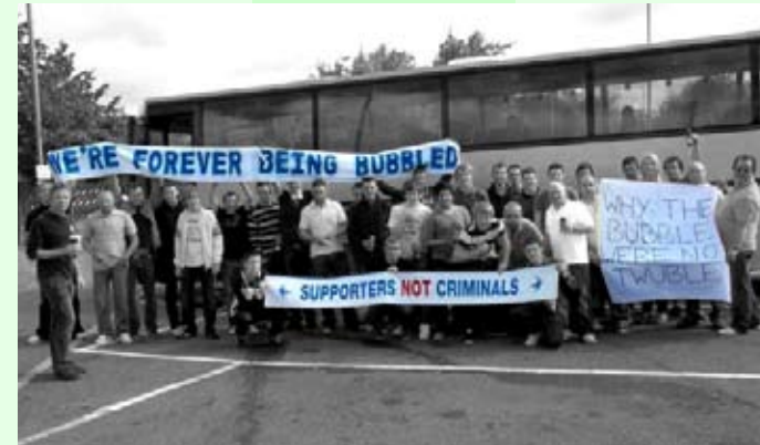
Cardiff City fans forced to travel on licensed coaches.

'Bubble' football matches are the culmination of years of growing restrictions on football fans who follow their team to away matches.